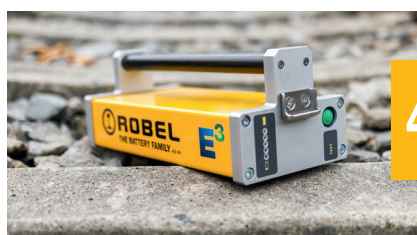
ROBATTERY 71.01 (400 Wh)

User-Friendliness Safety Emission Reduction HAV-Reduction